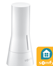
Automation hub: TaHoma®